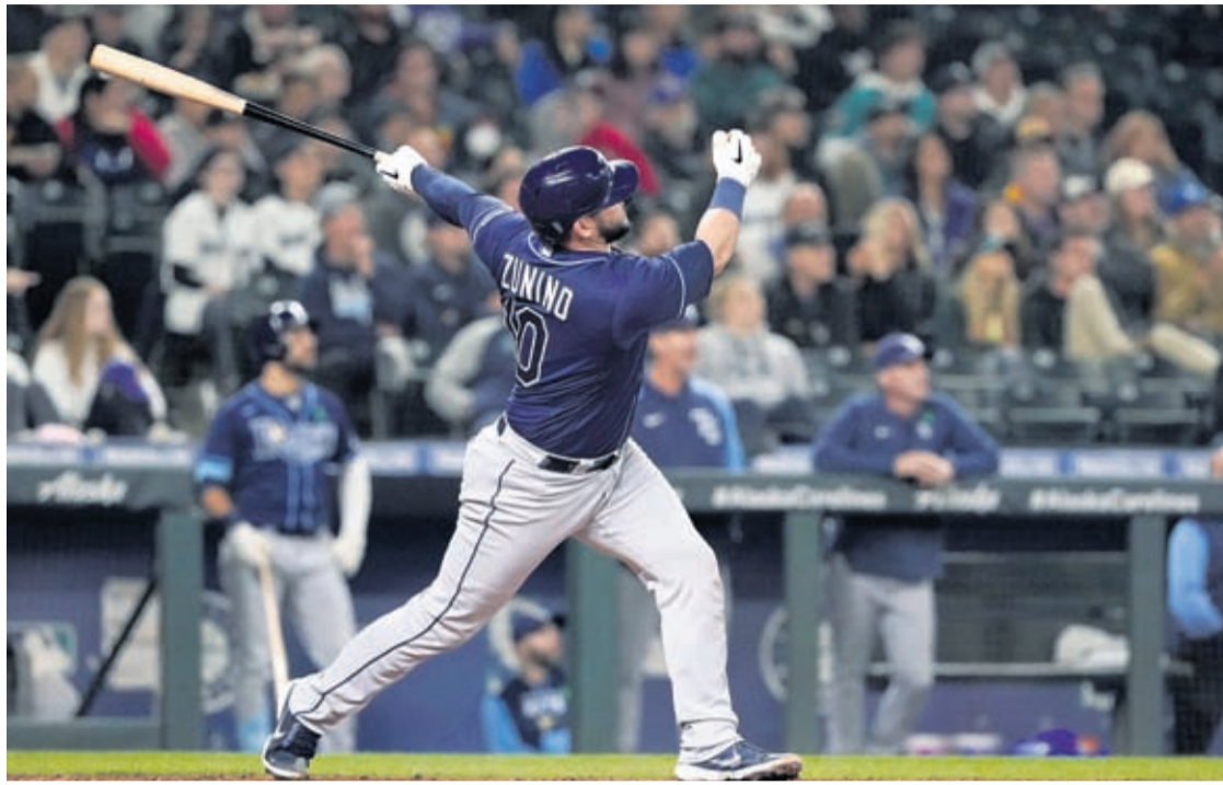
Tampa Bay Rays' Mike Zunino follows through on a three-run home run during the fourth inning of the team's baseball game against the Seattle Mariners, Thursday, May 5, 2022, in Seattle.